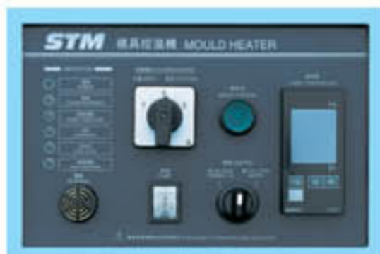
STM-1207-W/O Control Panel

STM - W/O series of dual - purpose heaters are mainly used to heat up the mould and maintain its temperature, although they can be also used in other similar applications. High temperature water or oil return from the mould is cooled by indirect cooling and then sent to the pipe heaters via high - pressure pump for heating to a constant temperature. This unique design allows user to choose between water and oil as heat transfer medium. With our optimised design, the OMRON temperature controller can maintain an accuracy of \pm 1^\circ\text{C} .