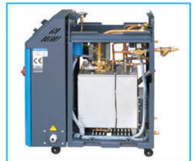
STM-1207-W/O Inner Structure