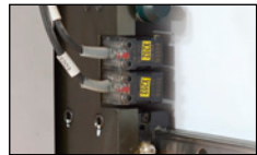
Proximity sensor FOTEC