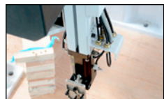
2 additional circuits to auxiliary chuckplates