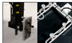
UP TOURING SETUP 0-90 degrees, gripper with suction pads